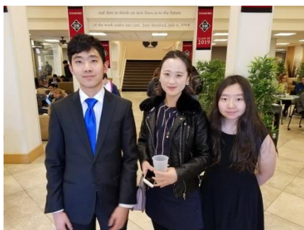
speech and debate season.