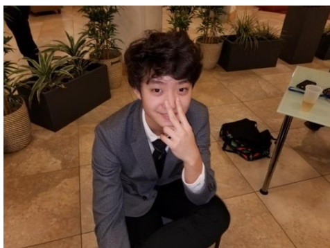
practices, clinics and competitive tournaments.

Though many students on these young teams were in their first years of debate, they won and placed at tournaments including one team's 4-3 win in open division at Princeton University, another team's Georgetown tournament win, and a third's place in semifinals at Pacific Lutheran University.