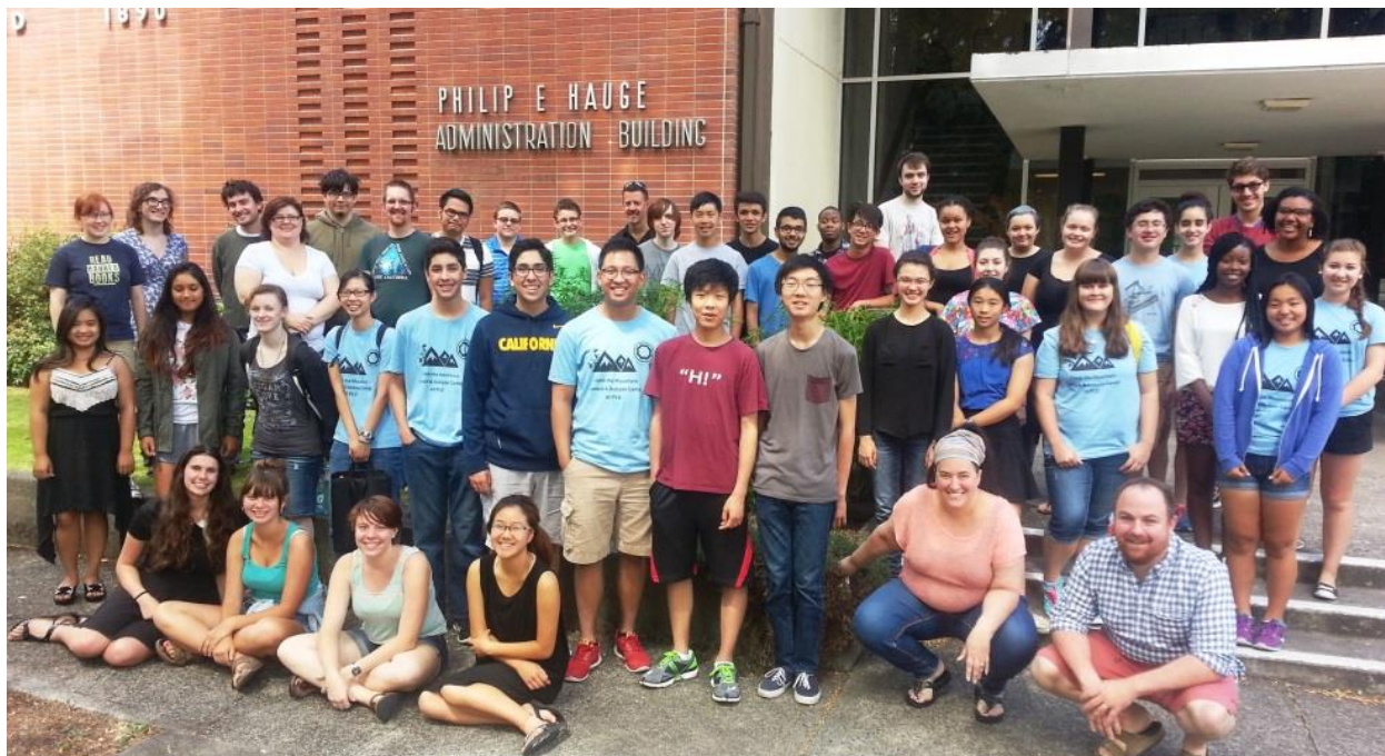
Some (not all!) of the students and coaches who participated in the Climb the Mountain Speech and Debate Camp at Pacific Lutheran University.